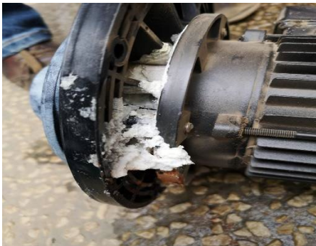
Chemical build up on a pump