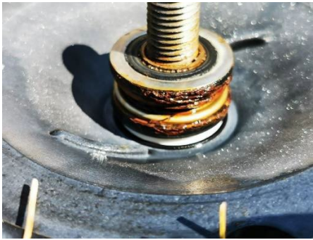
Corroded and rusted shaft seal for a pump