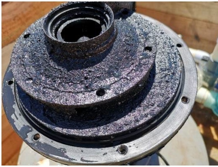
Corroded pump parts