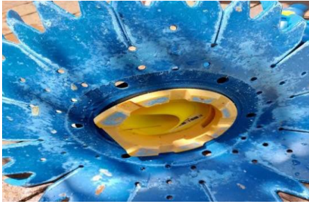
Sticky flexi foot and disc on a pool cleaner

Below are a few examples of damage caused due to incorrect water chemistry: